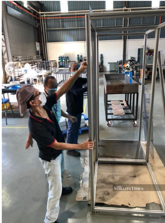
Apart from sanitising the person via the use of sanitising spray, the Covid-19 disinfection chambers will also measure the subject's body temperature.

KUALA LUMPUR: M3 Technologies (Asia) Bhd (M3Tech) and AT Engineering Solutions Sdn Bhd, a wholly-owned subsidiary of AT Systematization Bhd (ATS), have teamed up to develop facial tracker for Covid-19 disinfection chambers.